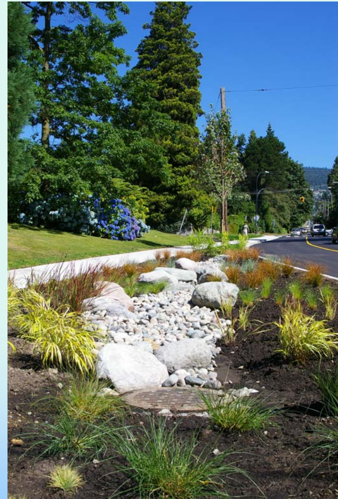
Rainwater Management & Green Infrastructure