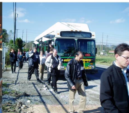
Then, the site visit and walkabout