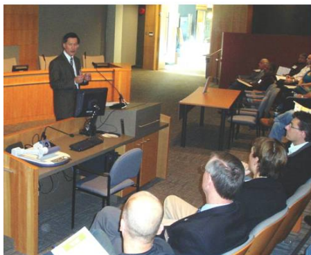
First, the project preview