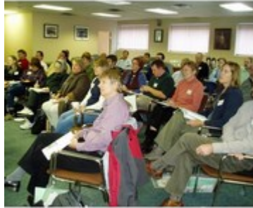
First, the project preview