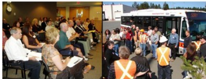
First, the project preview