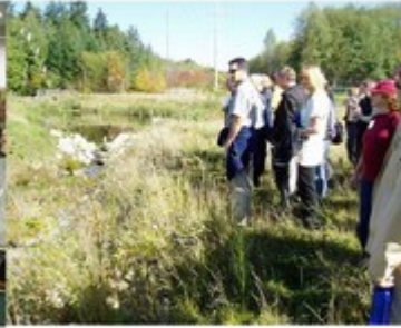
Then, the site visit