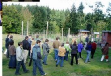
Then, the site visit