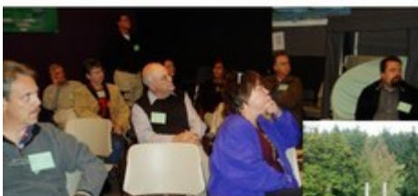
First, the case study overview