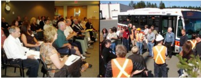
First, the project preview

Each event was co-hosted by a regional district and one or more of its member municipalities. Each event comprised presentations in the morning and a tour of project sites in the afternoon. Each event was unique.